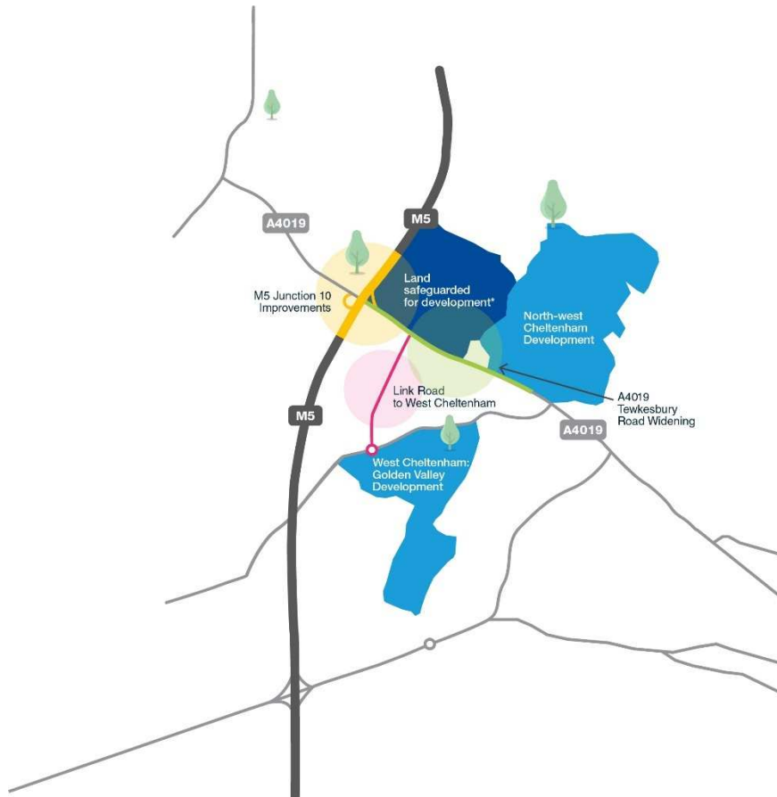
Figure 1 – Local context around M5 Junction 10 Improvements Scheme